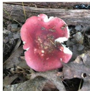
Needles and leaves one of those red things ☺