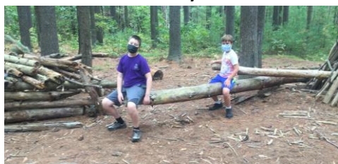
This exactly +25